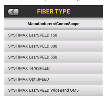
Figure 5. CertiFiber Pro supports all SYSTIMAX High Speed Migration fiber types

nm and 1300 nm, as provided by the CertiFiber Pro, provides adequate and prudent testing.