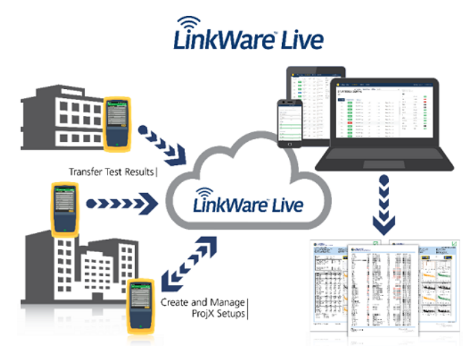
Figure 4. With LinkWare Live, Project Managers can create and manage test settings and transfer them to testers. Techs can upload test results, allowing the Project Managers to track job progress.

Fluke Networks LinkWare Live takes this concept to the next level by efficiently loading the entire project test plan complete with LL or ULL limits into the tester. This web-based service also features a built-in version of the SYSTIMAX loss calculator. Project Managers can set up the requirements for the project, including the SYSTIMAX limits, from their office on a PC or tablet. Technicians in the field can download the settings over Wi-Fi to one or more CertiFiber Pro units in the field, which is especially efficient for large projects as such as data centers. During testing, the CertiFiber Pro uses its length measurement result to calculate a precise limit for the link. Test results are uploaded over Wi-Fi to LinkWare Live, allowing the project manager to track overall progress or look at individual results.