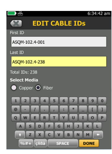
Touchscreen keyboard for faster data entry than the DTX

Waiting is the opposite of fast - but if your DTX battery is fully drained, you have to plug in and wait up to 15 minutes. 而 Versiv 只需插入电源,便可开始测试。